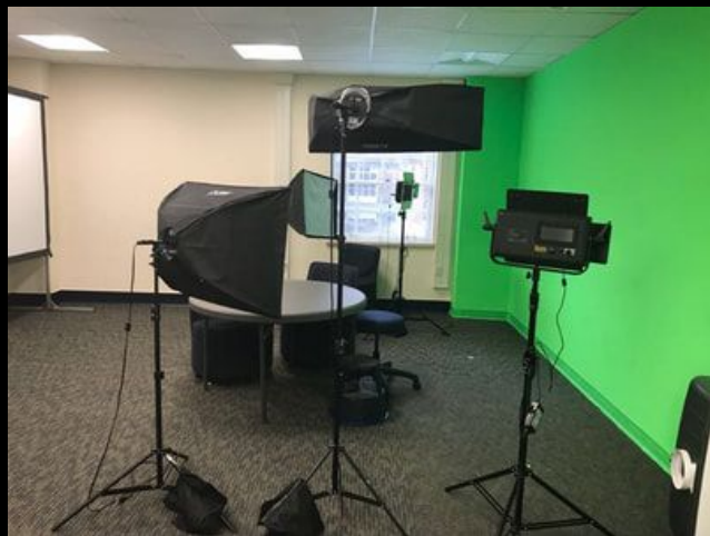
Lighting and Green Screen (Digital Commons)