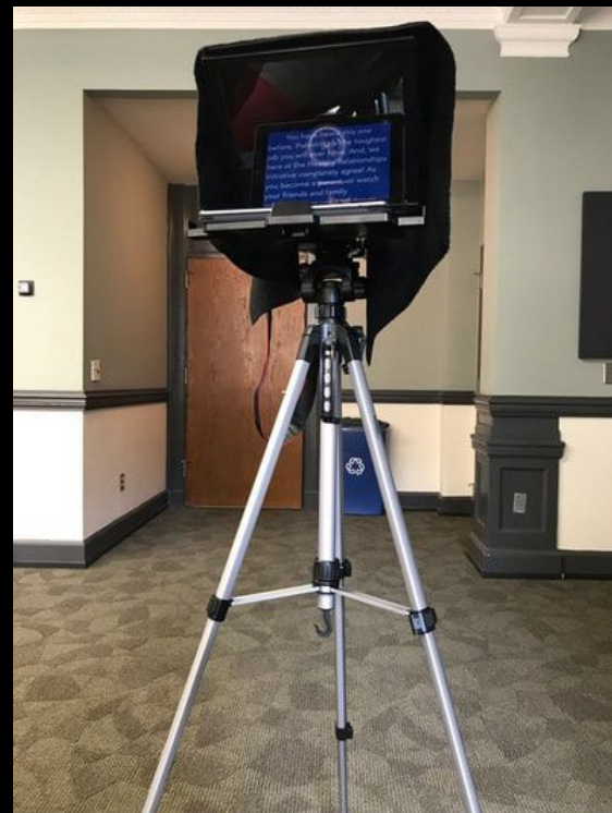
Teleprompter, iPad Pro, and Tripod